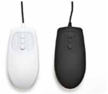
MIGHTY MOUSE Washable Silicone