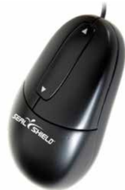
VALUE LINE MICE Washable