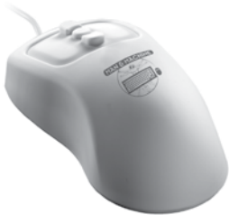
PETITE MOUSE Medical Grade