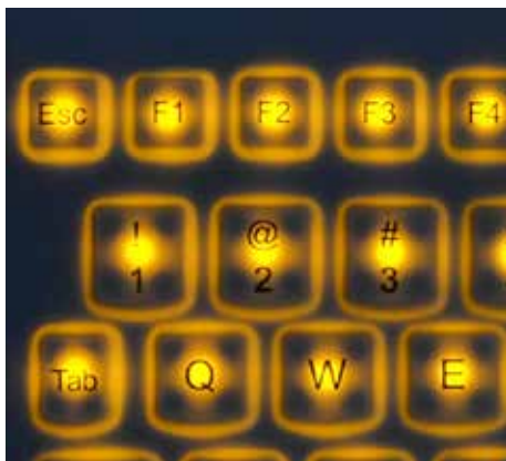
BACK-LIT KEYS Easy to see in dim light