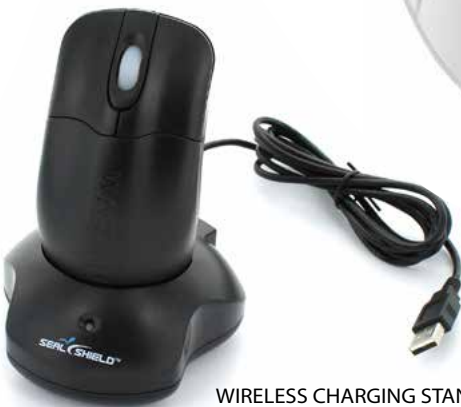
WIRELESS CHARGING STAND